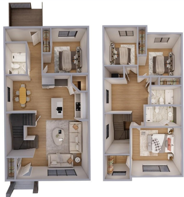
869 SQ.FT. MAIN FLOOR

Date Listed March 7th, 2025 Days on Market 34 Zoning Zone 91